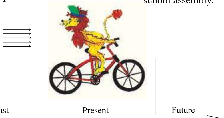
Fig. 1.1. Looking back at the past and learning what has happened belong to studying history.