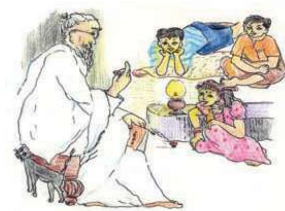
Fig. 1.2. Many things about history can be learnt from the elders.

We learn history referring to books written in ancient times; if not, with the help of the remaining articles used by the people who lived in the past. In addition to these two ways, we can learn about history through stories about the past narrated by our elders. There is a common term used to introduce everything which helps us to study history; that is 'a source'.