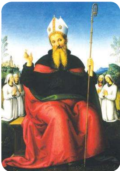
12.3 Picture - St. Augustine