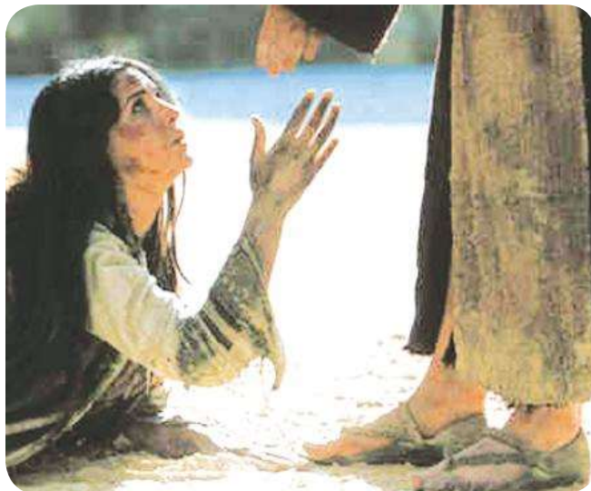
12.2 Picture - Lord Jesus forgave the woman caught in adultery