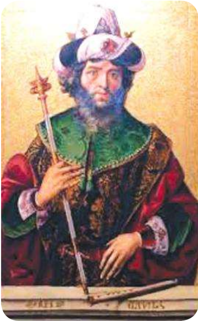
10.2 Picture - King David

Since Saul disobeyed God, God ordered Samuel to appoint a new king. As guided by God, Samuel went to Jesse's house in Bethlehem. Jesse belonged to the tribe of Judah. He was to select one of his sons. Looking at the eldest son, he thought he was the suitable person, but God said: "Do not look at his appearance or on the height of his stature, because I have rejected him; for the LORD does not see as mortals see; they look on the outward appearance, but the LORD looks on the heart" (1 Samuel 16:7).