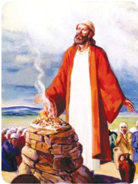
10.1 Picture - King Saul

The first king of Israel was Saul. He was the son of Kish of the tribe of Benjamin. He had a unique personality and was young. He went in search of the donkeys, which had strayed. Meanwhile he met Samuel by chance. The following passage elaborates the anointing of Saul as king as instructed by God: