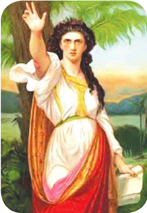
9.1 Picture - Deborah, the heroine

She was an intelligent woman. During her time, a Canaanite king harassed the Israelites. Therefore, the Israelites prayed to God. According to the advice of Deborah, Barak led an army of ten thousand against the Canaanite army. When Canaanites learnt that Barak came to the Mount Tabor, they were ready to fight. Deborah encouraged Barak, the commander in chief of Israelite army to fight against the Canaanite army. Due to grace of God, The Israelite army won the war. Deborah explained that the victory is not of the Israelite army but that of God.