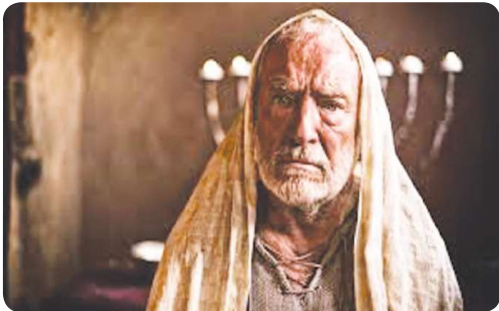
9.3 Picture - Samuel, the Judge