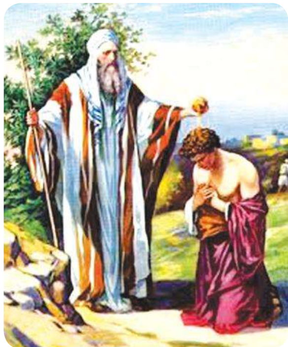
9.5 Picture - Samuel consecrates David