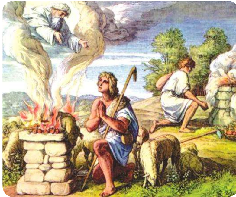
Picture 7.1 - Cain's and Abel's Offerings

Adam and Eve had two sons, namely Cain and Abel. Abel was a shepherd. Cain was a farmer. After some time, Cain made an offering to God out of the harvest that he made from the ground. Abel offered the firstlings of his flock. God accepted Abel and his offering, but not Cain and his offering. Therefore, Cain got angry and he was jealous of Abel. Hence, God advised Cain: