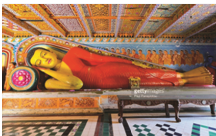
A reclining statue of the Buddha

Join these sentences using relative pronouns, who , which or that . The first one is done for you.