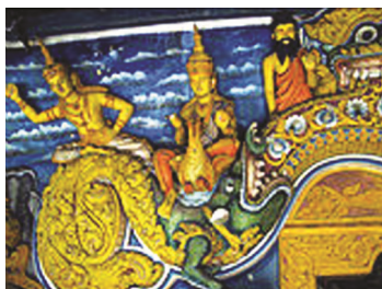
An Arch of the Dragon